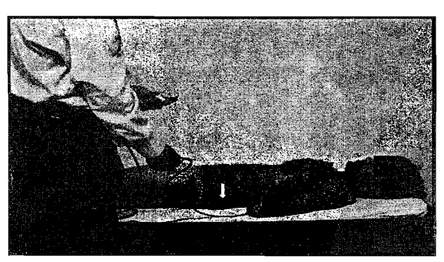
Fig. 1. Figures shows measurement of spinal column pressure changes in supine lying position (a) and abdominal pressure changes in prone lying position (b) by PMD.

This is a observational, prospective and only case study of patients.